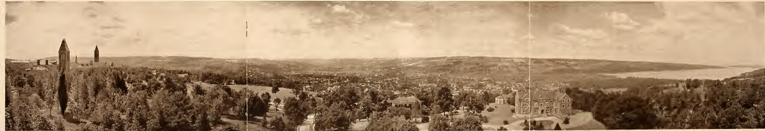
VIEW FROM THE CAMPUS OVER THE CITY AND THE LAKE